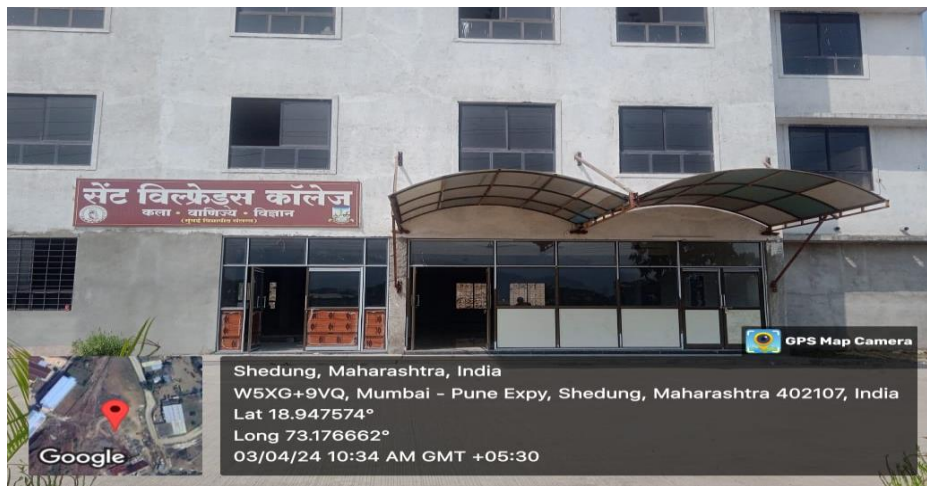
College Main Gate