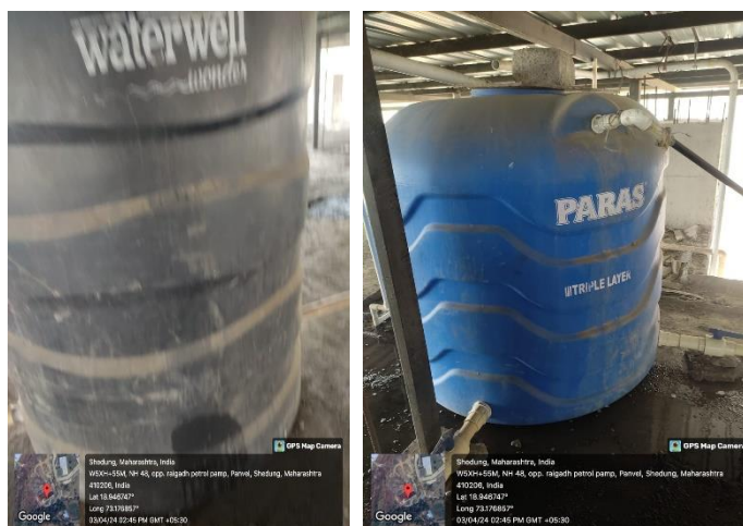
Overhead Water Tank