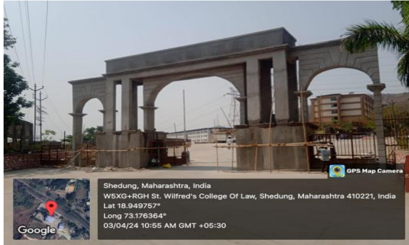
College Main Gate